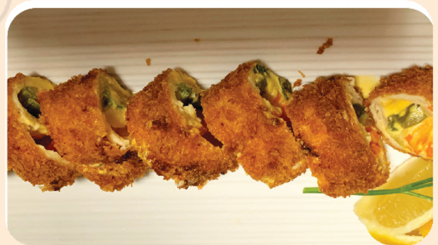
CHICKEN CHEESE ROLL