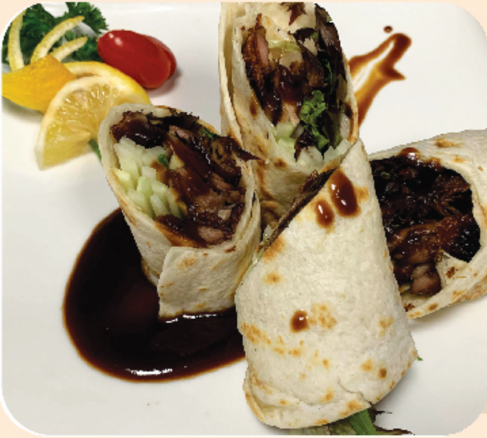
CRISPY DUCK ROLL