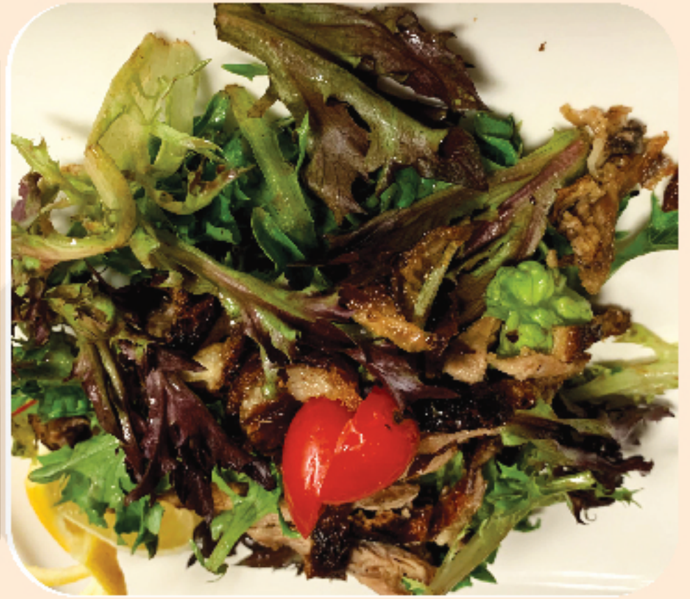
ROASTED DUCK SALAD